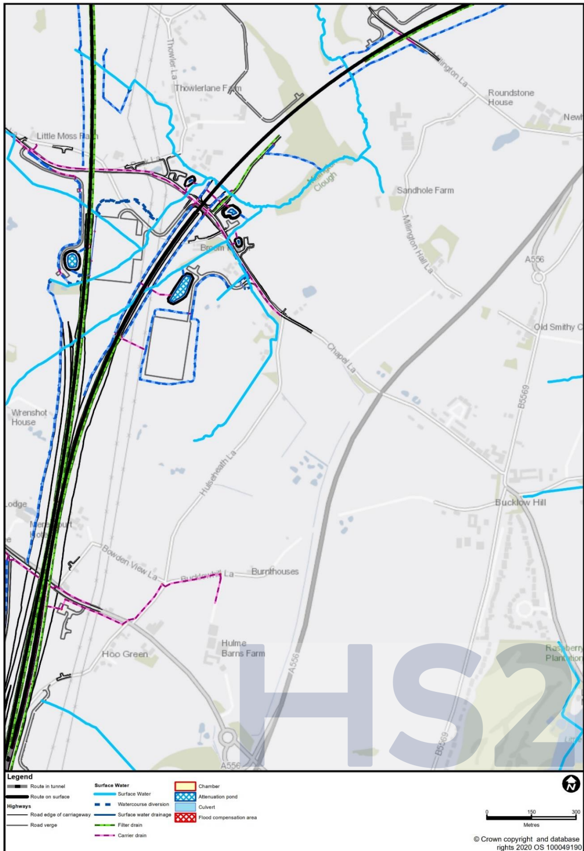
Figure 1: A556 existing drainage to Chapel Lane Drain